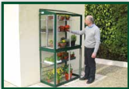
The Hampton is ideal where space is limited, with the lean-to design minimising floor space.

The Chatsworth is the jewel in the crown of the Access range, but we manufacture a very wide range of lean-to and free-standing models. For our full range, visit our website www.garden-products.co.uk