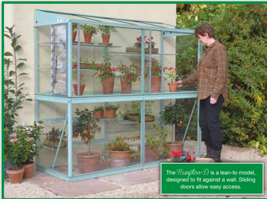
The Hampton-D is a lean-to model, designed to fit against a wall. Sliding doors allow easy access.

This means you can start gardening under glass NOW and pay later.