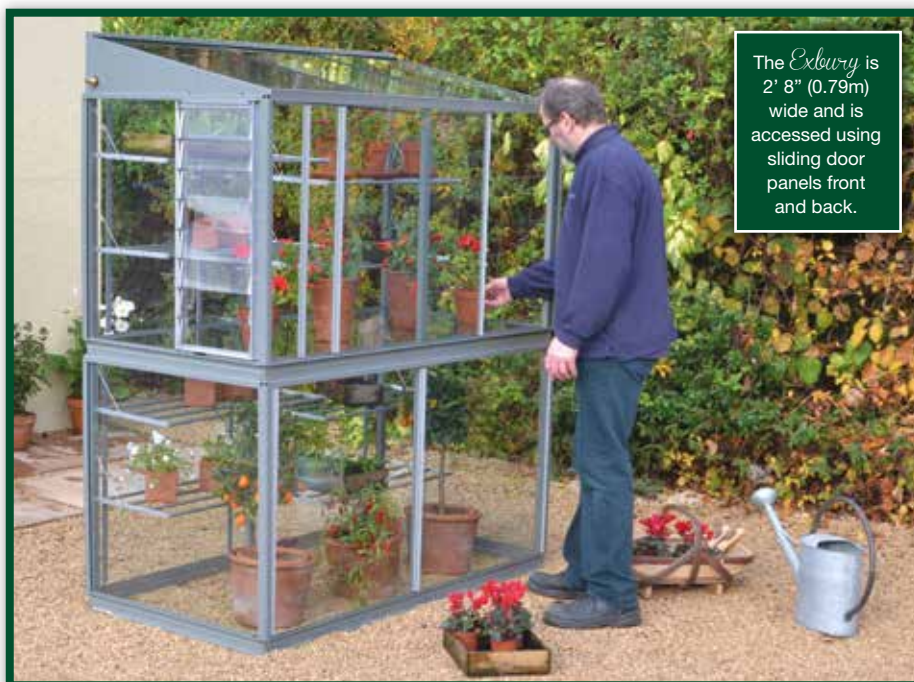
The Exbury is 2' 8" (0.79m) wide and is accessed using sliding door panels front and back.